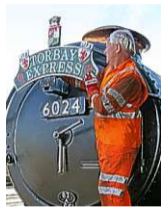
Finishing touch: The Torbay Express headboard is fitted