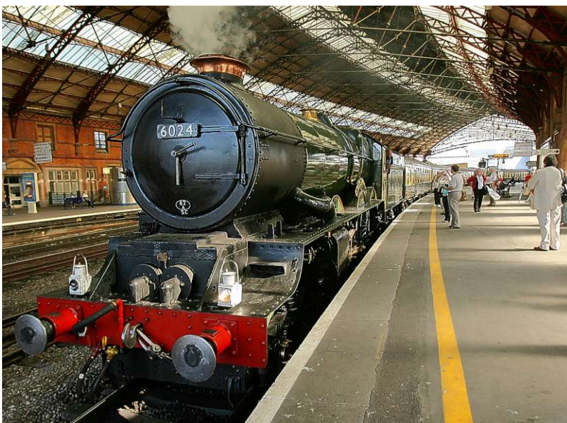
All aboard: King Edward I brings the Torbay Express into Temple Meads before