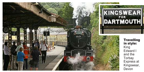
Travelling in style: King Edward I and the Torbay Express at Kingswear, Devon